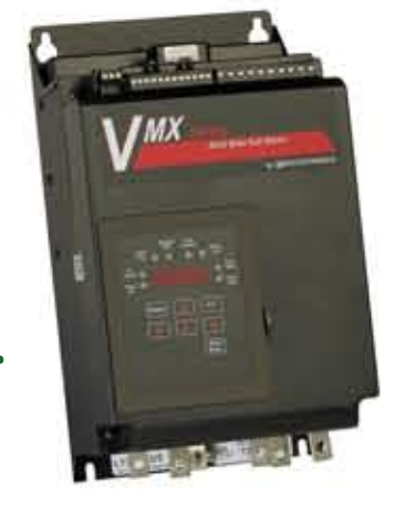
Closed Loop Torque Ramp

Eliminate Water Hammer with Pump-Flex Decel Control. A gradual reduction in the output torque of your pump motor is provided when a stop signal is initiated. Check valves close gently and other fluid system components are no longer subjected to the shock and destructive potential of water hammer.