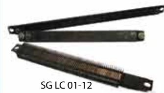
SG LC 01-12