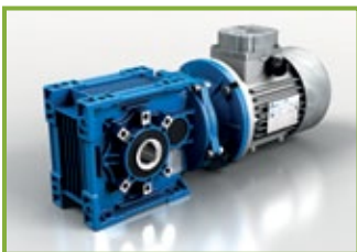
BA Fitted for motor coupling