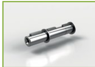
Single Output Shaft