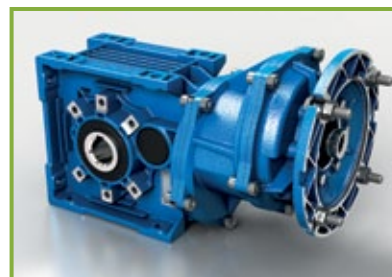
BA.. 3 Stages Foot/Flange Mounting

Different versions are available with hollow output shafts. Single/double solid output shafts are only available for the BA70.