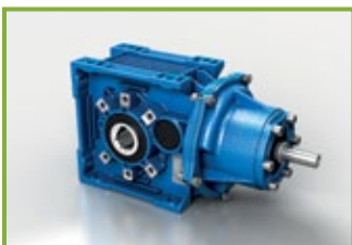
IBA With input shaft