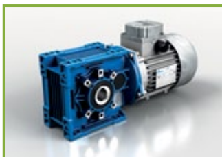
CBA With compact motor