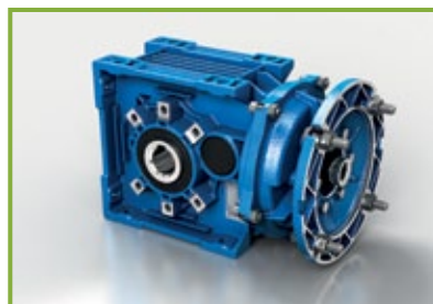
BA.. 2 Stages Foot/Flange Mounting

Different versions are available with hollow output shafts and single/double solid output shafts.