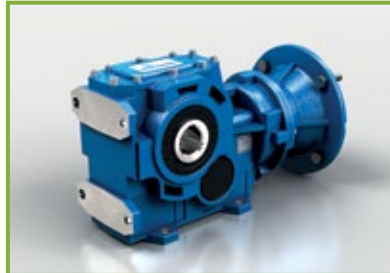
B... FC Foot Mounting