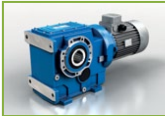
CB With compact motor