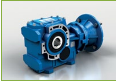
B... SC Flange Mounting