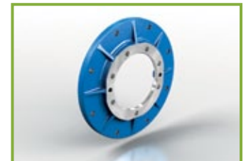
FB - FC - FD