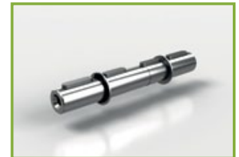
Double Output Shaft