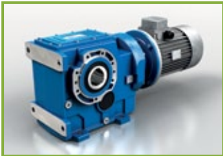
B-PB Fitted for motor coupling - Coupling with flexible coupling

The technological content of B-Series gear reducers allows for an extraordinary performance/lifespan ratio . These highly versatile gear units are successfully used in a vast number of industrial and civil applications. B-Series units offer excellent value for money and output torque/weight ratio , especially considering that they need very limited servicing. The units are available in cast iron (sizes 063 to 163) or aluminium (sizes A42 to A73) casing.