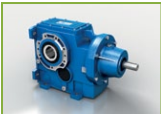
IB With input shaft