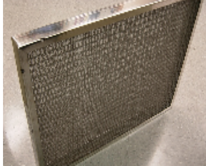
Figure 1: Typical high velocity filter panel

They are no longer available and have been replaced by permanent viscous impingement filter such as Mist Eliminator type. The Mist Eliminator is highly effective in significantly reducing oil mist, water mist, fog or droplets from outside air or re-circulated air (See Figure 1). It is designed to operate at a face velocity of 500 FPM and not exceed 550 FPM. (See Figure 2).