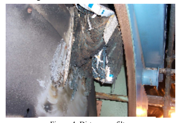
Figure 4: Dirty paper filter was sucked into motor

insulation, which may lead to insulation failures.